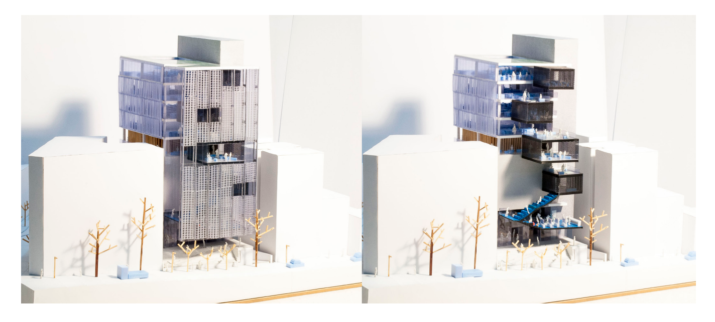
Figure 5. GOSP HQ, thick-envelope promenade. N8Studio, 2018.

Without a clear definition of this spatial barriers, now in the depth of the thick-envelope , the agency of the performance of this barriers are put to question – and the role of the architect is expanded and gets confused with that of the urbanist – the subject of the architecture becomes the city as much as the user of the building, not any longer in two distinct buildings, as proclaimed by Gandelsonas, but in the intersection space in them – the thick-envelope . Manuel de Solá-Morales, describing the impossibility of the project for a public space, proposes