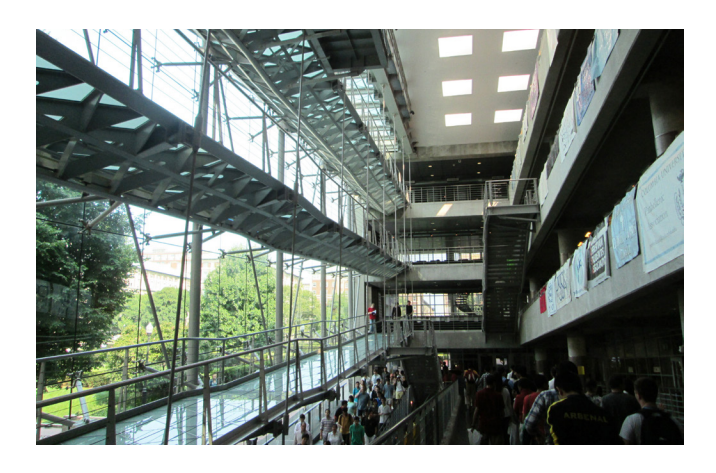
Figure 3. Lerner Hall, interior.

When Bernard Tschumi's Lerner Hall (1994-99) [Figure 03] creates a thick envelope composed by ramps inset between the modern glass and a historicist composition, the building's character is not expressed by an applied apparatus, or dissolved in a factual expression of the building's function (in other words, neither post-modern nor modernist). Here, I argue that for the first time the contemporary façade assumes – consciously by the architect – a thickness that negotiates a relationship between interior and exterior, an in-between space that questions the fundamental position of the envelope: that of the limit, of a permeable skin that wrap and encloses the interior – designed and controlled by the architect – from the exterior, the domain of the city.